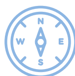
Ethics & Compliance Pulse Pages